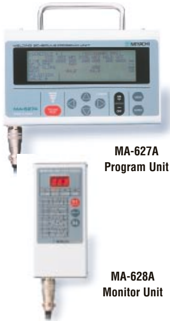
MA-627A Program Unit